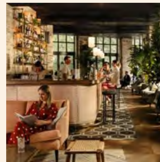
Southwark, London Our third London Hoxton a stone's throw from South Bank.