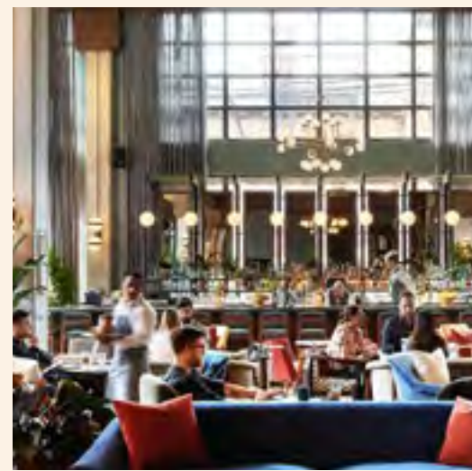
Chicago Situated in the Fulton Market District.