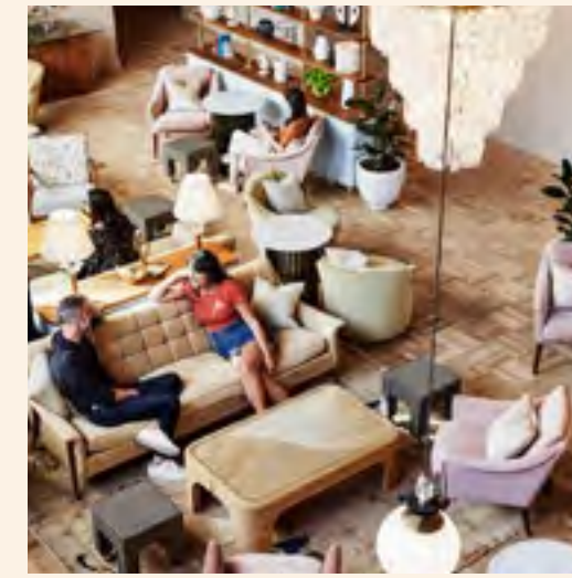
Williamsburg, NYC Situated in Brooklyn's creative heart, Williamsburg.