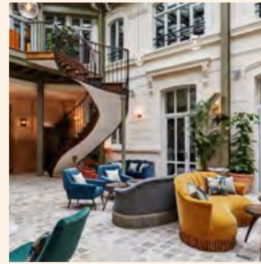
Paris Located in Paris's 2nd Arrondissement.