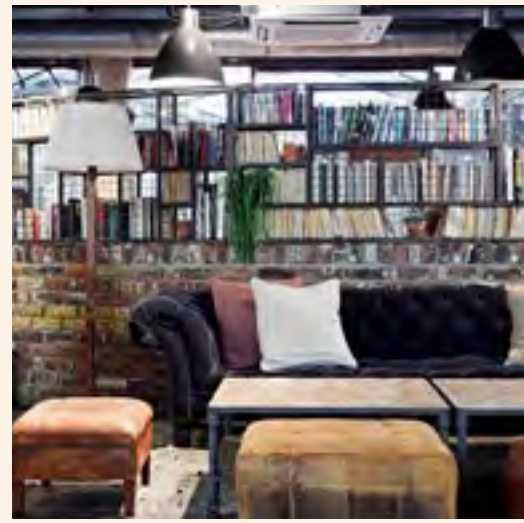
Shoreditch, London Birth of the Hoxton Hotels, right in the heart of East London.