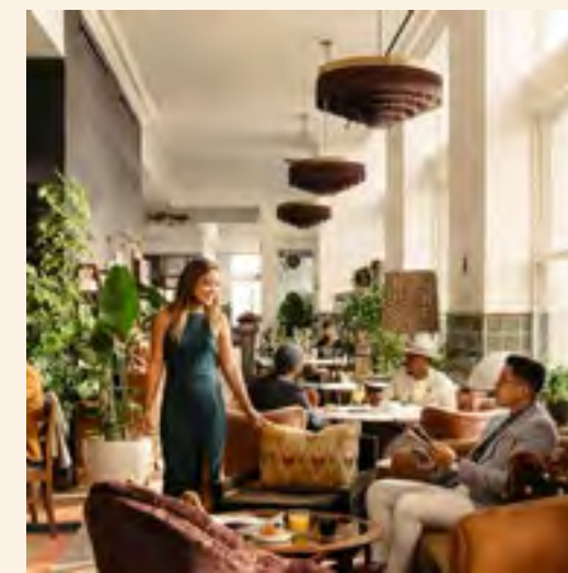
Downtown LA A historic Broadway building located in Downtown LA.