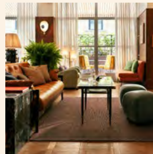
Rome Our first Hoxton in Italy, situated in the leafy neighbourhood of Parioli.