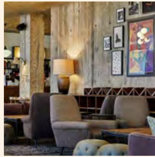
Holborn, London Former BT Exchange building converted into second London Hoxton.